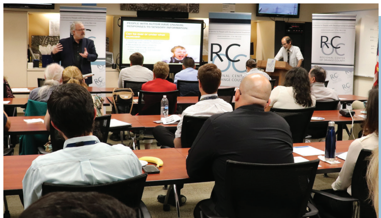
The partnership was the subject of a front page story in the Orange County Register.

R COC is proud to have partnered with John Wayne Airport on the Airport’s Helping Hands program, providing sensitivity training aimed at supporting the Airport’s efforts to ensure a safe and comfortable experience for all travelers. We also included a new section about airport travel and assistance available from Helping Hands and the TSA in our 2019 Recreation Resources Guide. To download the Guide in English, Spanish or Vietnamese, go to the RCOC website and click on Resources for Children under the Family Support tab, then scroll down to the Recreation link. Or you can contact your RCOC Service Coordinator or RCOC’s Comfort Connection Family Resource Center at (714) 558-5400 or ccfrc@rcocdd.com .